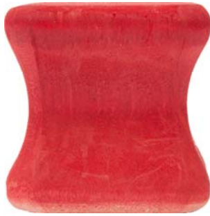
Ordnance (wooden block)