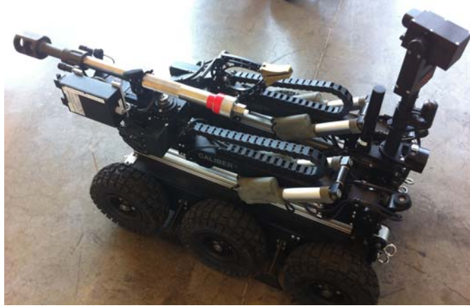
Explosive Ordnance Disposal Robot, Springfield (MO) Fire Department